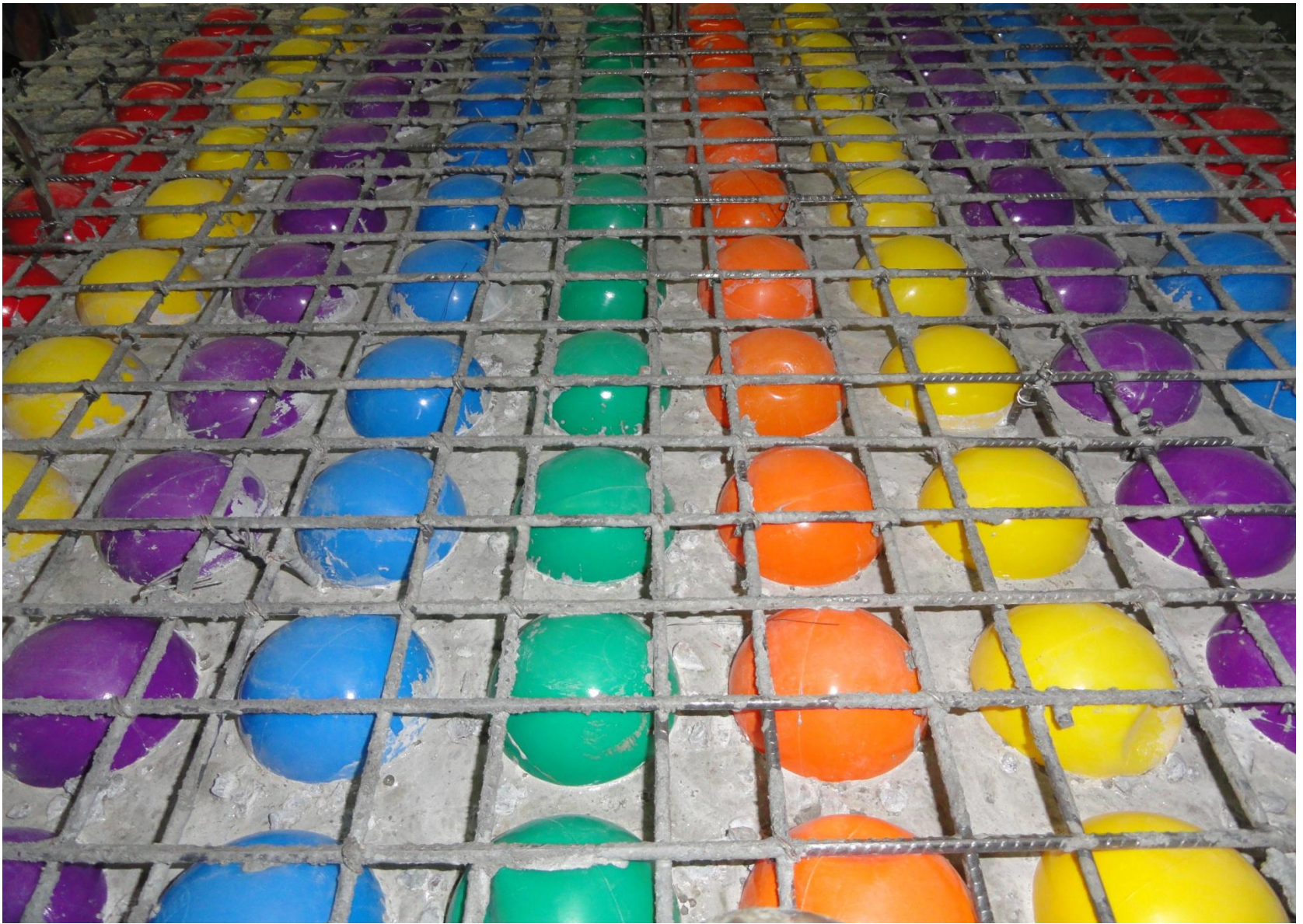
Bubbled RC Slab System